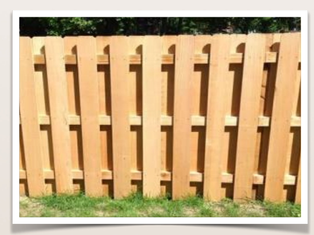
Design Example: Shadowbox

All fences shall have the finished side facing out with post and supports to the inside.