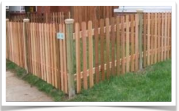
Design Example: Open weave

Fences built with valid permits prior to the e ective date of this chapter or fences on properties annexed to the City after the e ective date of this chapter are exempt.