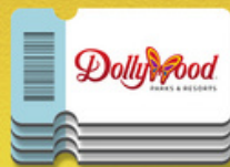
4 Dollywood Theme Park tickets

& $2,000 USD/CAD/AUD or £2,000 GBP donated to their Local Program Partner in their name!