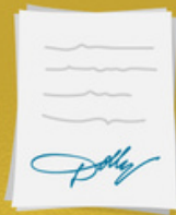
Personalized, signed letter from Dolly