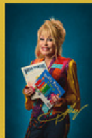
Autographed photo from Dolly