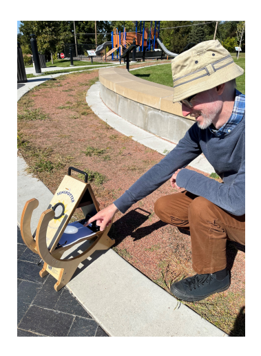
Science enthusiast using the Sunspotter

Drop in between 10:00 am and noon and join us for viewing the partial solar eclipse and hands on activities for the whole family. The following activities will be available: Citizen Science (cloud identification, temperature recording and sound recording during the eclipse); Solar Station (sun spotter and pinhole cameras to safely view the eclipse); Space Games (various); Stomp Rockets; Rocket Coloring and Bear's Shadow (book) Activities.